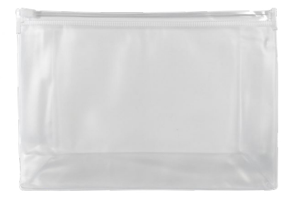
роснетте SIZE: 22 X 14 X 5 CM COD. 025H51OSP