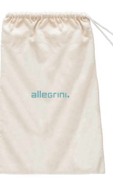
Bag SIZE: 16 X 21 CM COD. 025HP03305