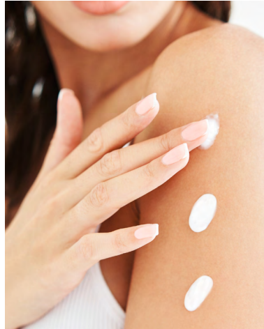
HAND & BODY LOTION moisturizing

A formulation with a gentle foam, ideal for cleansing, nourishing and softening the skin. An enveloping experience that brings vitality to the whole body.