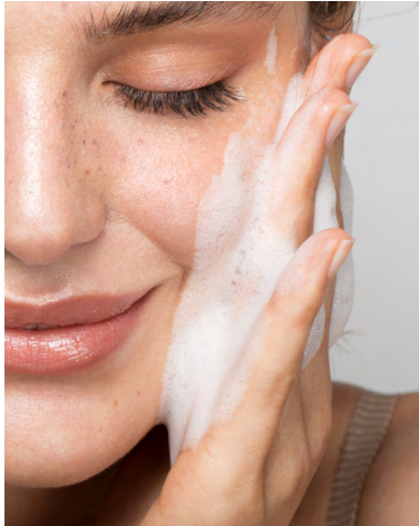
SHOWER GEL softening

A formulation with a gentle foam, ideal for cleansing, nourishing and softening the skin. An enveloping experience that brings vitality to the whole body.