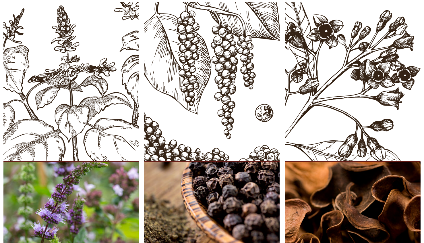
top notes PATCHOULI

A sensual fragrance where the intense notes of patchouli, pepper and sandalwood are combined with sparkling notes of cedar, giving vitality to the whole body. The pleasure of a delicate line, with a fragrance that is always discreet and refined.