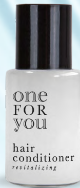
hair conditioner bottle 20 ml