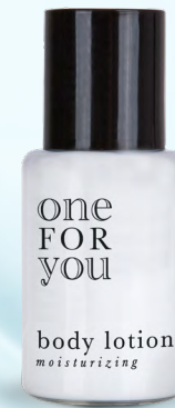
body lotion bottle 20 ml