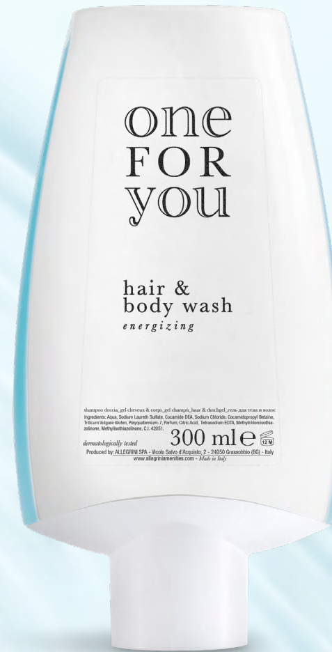
hair & body wash ConTatto 300 ml