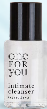
intimate cleanser bottle 20 ml