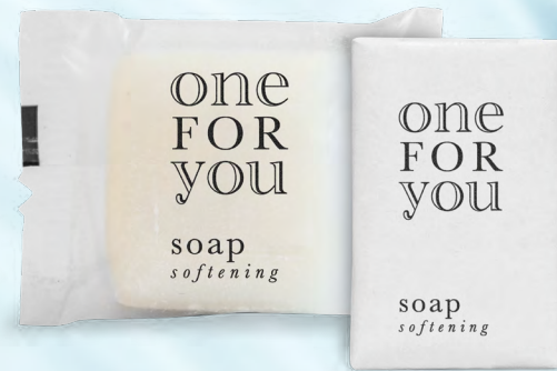
soap flow pack 15 g