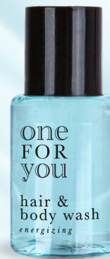
hair & body wash bottle 20 ml