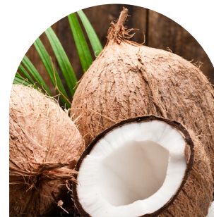
MIDDLE NOTES COCONUT