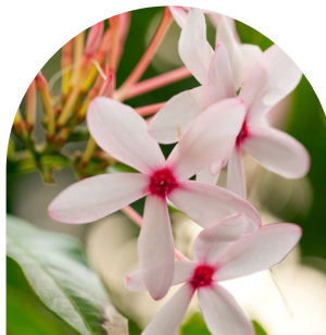
TOP NOTES FLORAL

Exciting notes of Tiaré flowers that recall a warm tropical island with a beautiful sea, a magical and pure jewel. A fresh and elegant fragrance which is able to involve the senses, ideal for those who love exotic atmospheres.