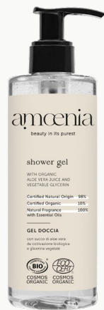
Shower gel cod. 026SG357800 | 300 ml