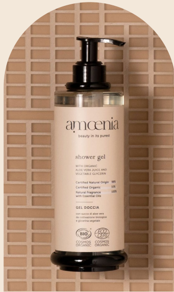
COMBINED WALL BRACKET