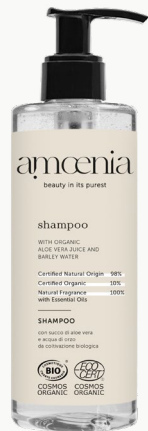
Shampoo cod. 026SH357800 | 300 ml