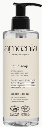
Liquid soap cod. 026LS357800 | 300 ml