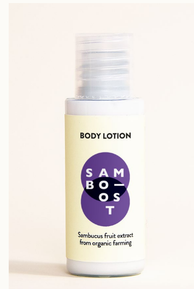
BODY LOTION - 30 ml Body lotion with elderberry fruit extract from organic farming.