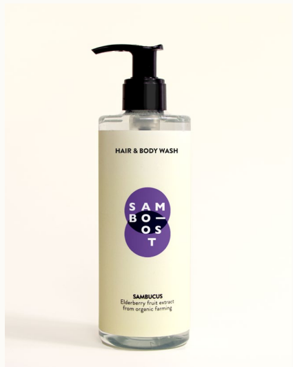
HAIR & BODY WASH - 300 ml Hair & body wash with elderberry fruit extract from organic farming.