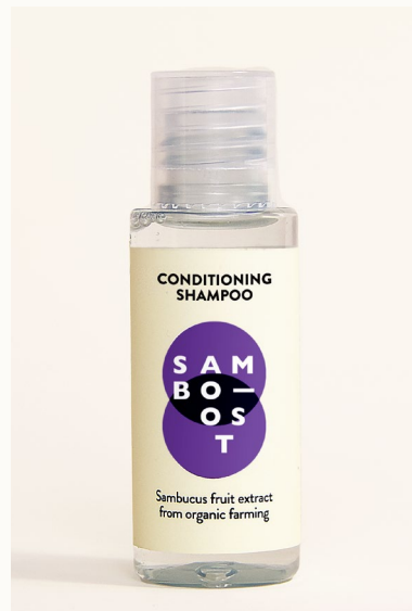
CONDITIONING SHAMPOO - 30 ml Conditioning shampoo with elderberry fruit extract from organic farming.