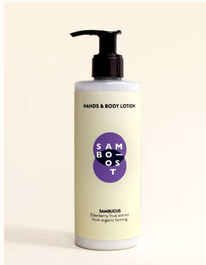
HANDS & BODY LOTION - 300 ml Hands & body lotion with elderberry fruit extract from organic farming.