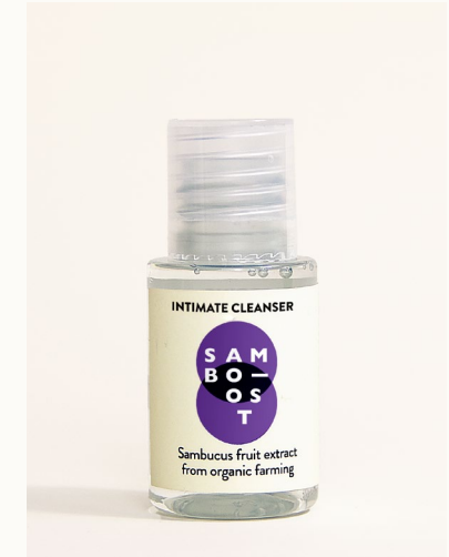
INTIMATE CLEANSER - 20 ml Intimate cleanser with elderberry fruit extract from organic farming.