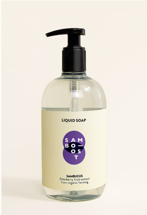
LIQUID SOAP - 500 ml Liquid soap with elderberry fruit extract from organic farming.