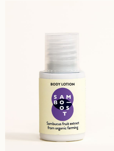
BODY LOTION - 20 ml Body lotion with elderberry fruit extract from organic farming.