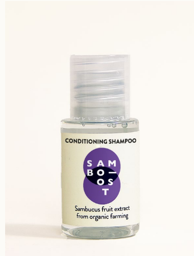
CONDITIONING SHAMPOO - 20 ml Conditioning shampoo with elderberry fruit extract from organic farming.