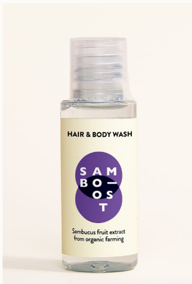
HAIR & BODY WASH - 30 ml Hair & body wash with elderberry fruit extract from organic farming.