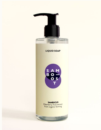
LIQUID SOAP - 300 ml Liquid soap with elderberry fruit extract from organic farming.