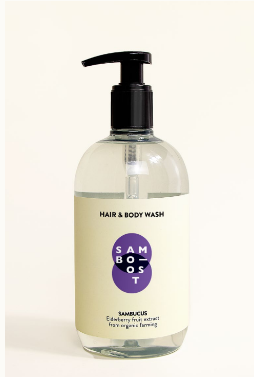
HAIR & BODY WASH - 500 ml Hair & body wash with elderberry fruit extract from organic farming.