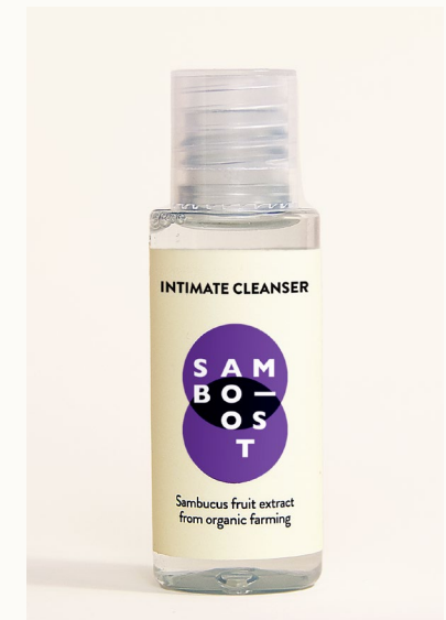
INTIMATE CLEANSER - 30 ml Intimate cleanser with elderberry fruit extract from organic farming.