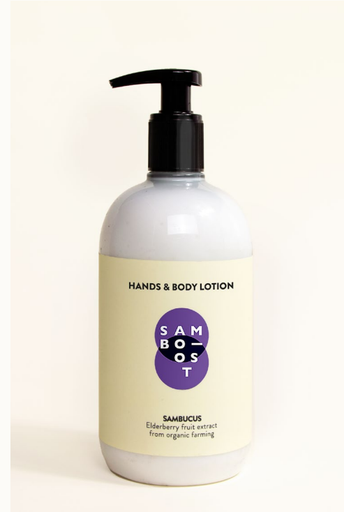
HANDS & BODY LOTION - 500 ml Hands & body lotion with elderberry fruit extract from organic farming.