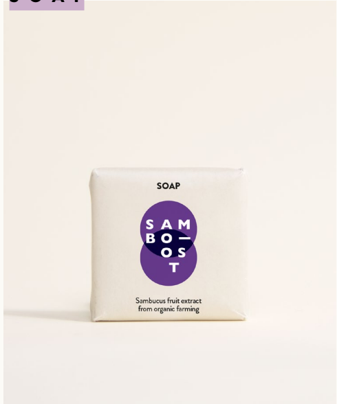
SOAP - 15 g Soap with elderberry fruit extract from organic farming.