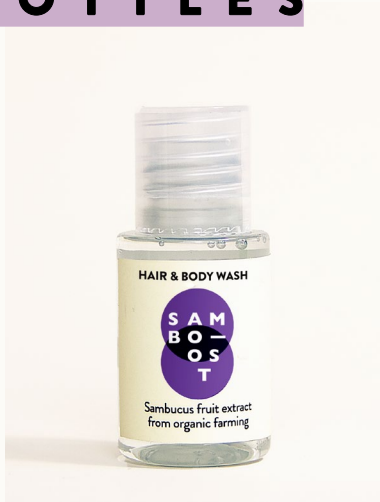
HAIR & BODY WASH - 20 ml Hair & body wash with elderberry fruit extract from organic farming.