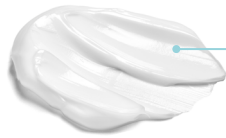
BODY LOTION MOISTURIZING

A formulation with a gentle foam that cleanses, calms and nourishes, keeping skin in balance.