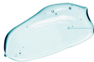
SHOWER GEL RELAXING

Unique ingredients compose this line: the linseed extract has emollient and soothing properties that make it suitable also for delicate skin, furthermore it gives nourishment and vitality to the hair. The vitamin E has antioxidant properties to prevent skin ageing.