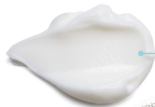
HAIR CONDITIONER NOURISHING

It gently cleanses and leaves hair shiny and nourished. Suitable for all hair types, perfect for everyday use.