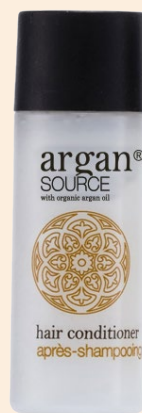
HAIR CONDITIONER 30 ml