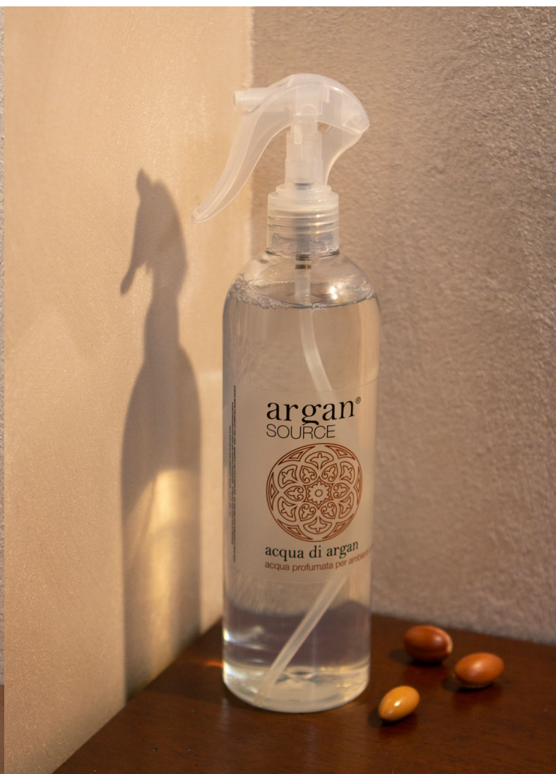
500 ml Scented water