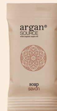
SOAP 15 g