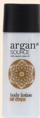
BODY LOTION 30 ml