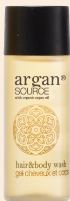
HAIR&BODY WASH 30 ml