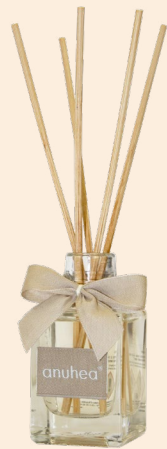
ROOM DIFFUSER 40 ml