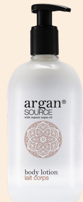
BODY LOTION 500 ml