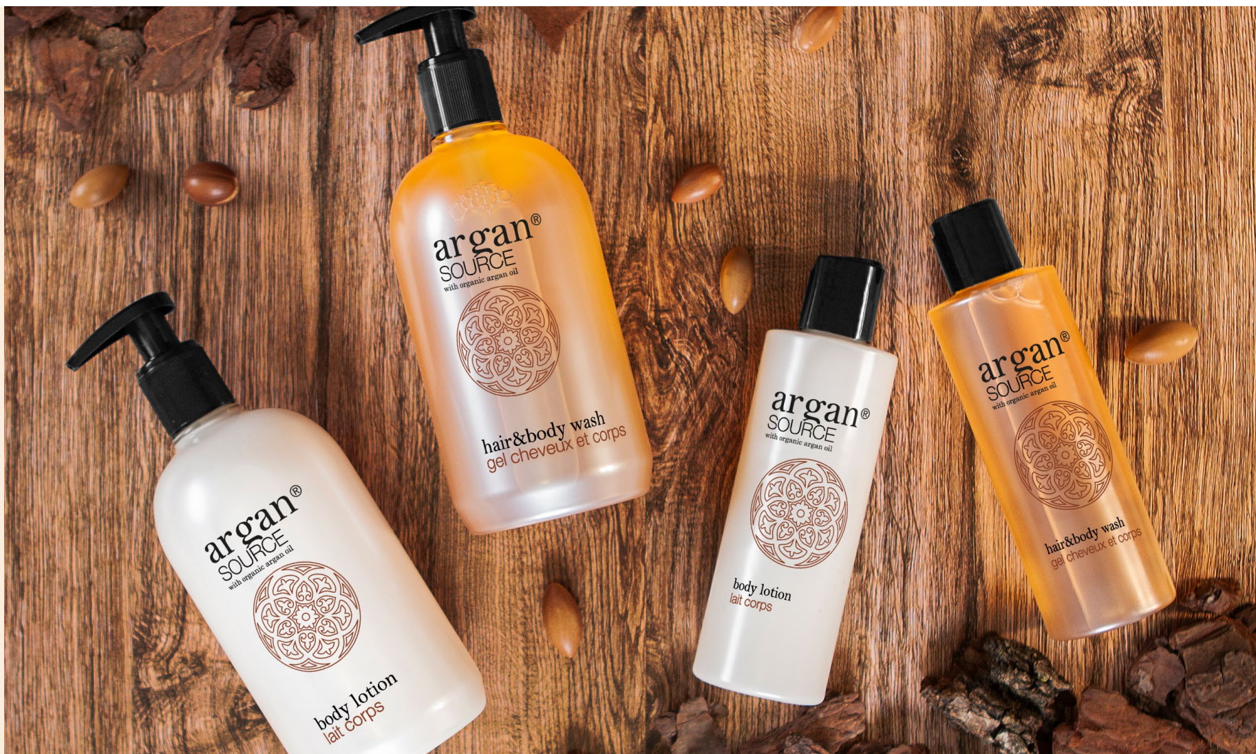
500 ml Dispenser - 200 ml Dispenser