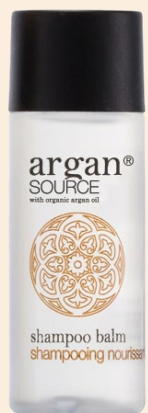
SHAMPOO BALM 30 ml