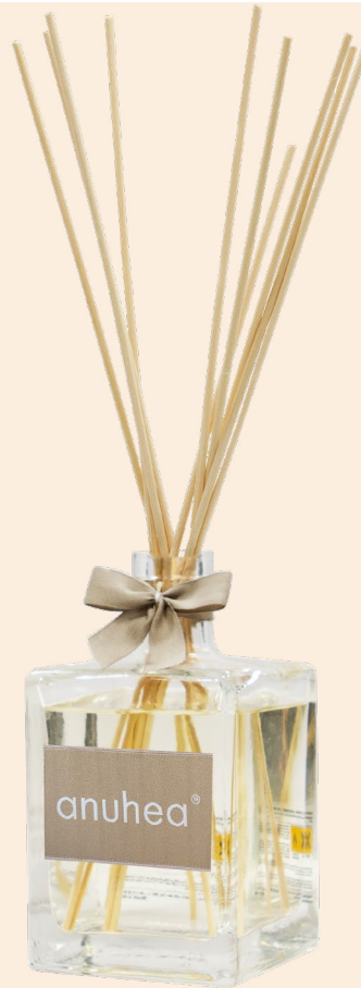
ROOM DIFFUSER 400 ml