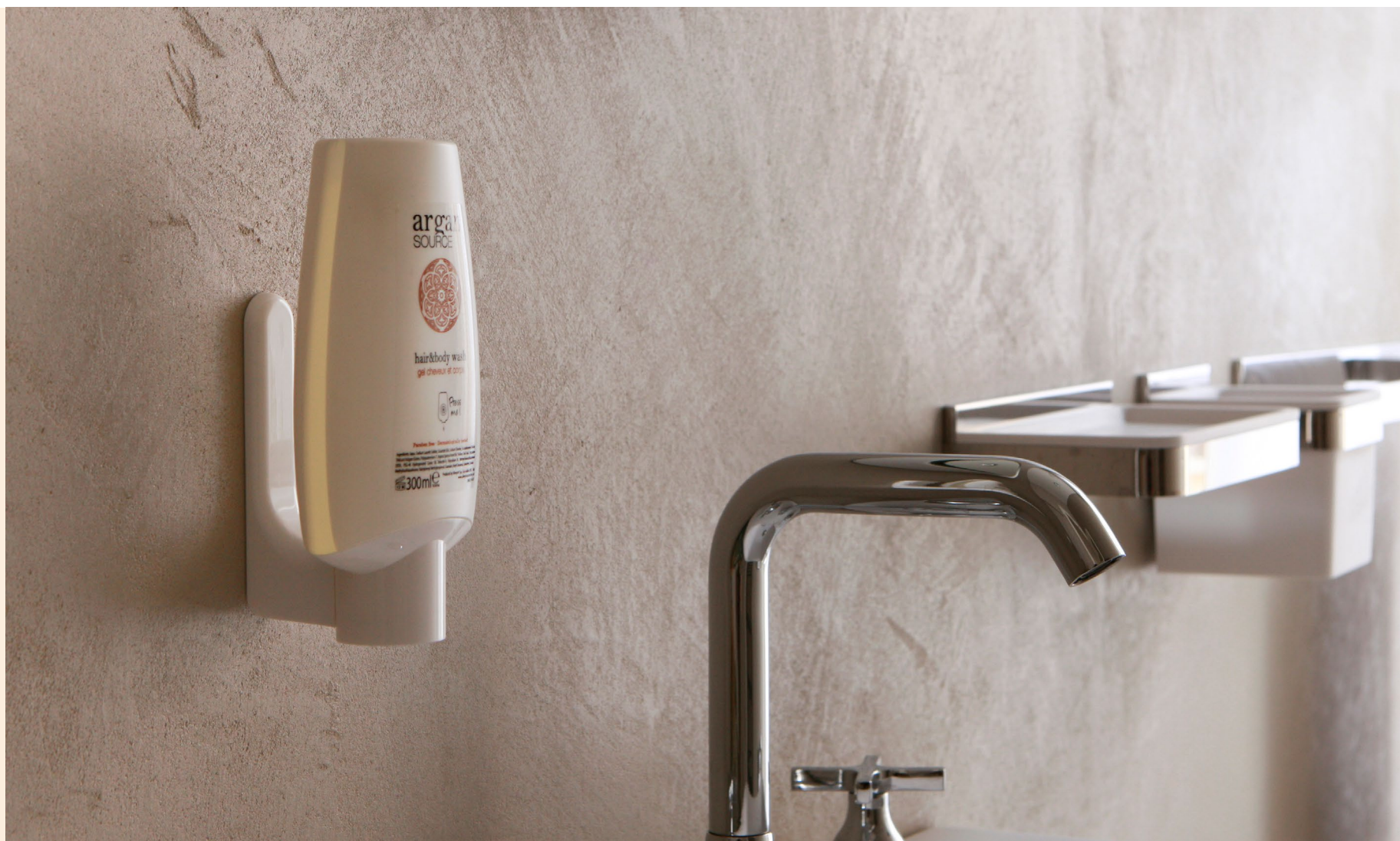
300 ml ConTatto