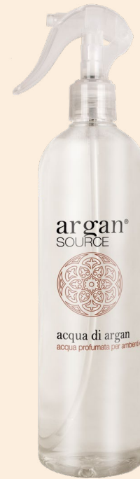
SCENTED WATER 500 ml