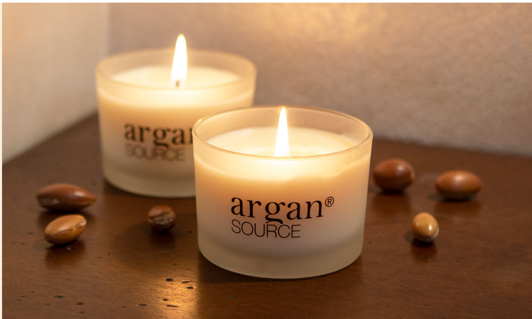
140 g Scented candle