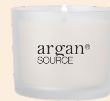
SCENTED CANDLE 140 ml