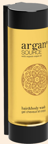
HAIR&BODY WASH 350 ml