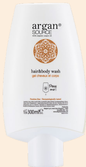
HAIR&BODY WASH 300 ml