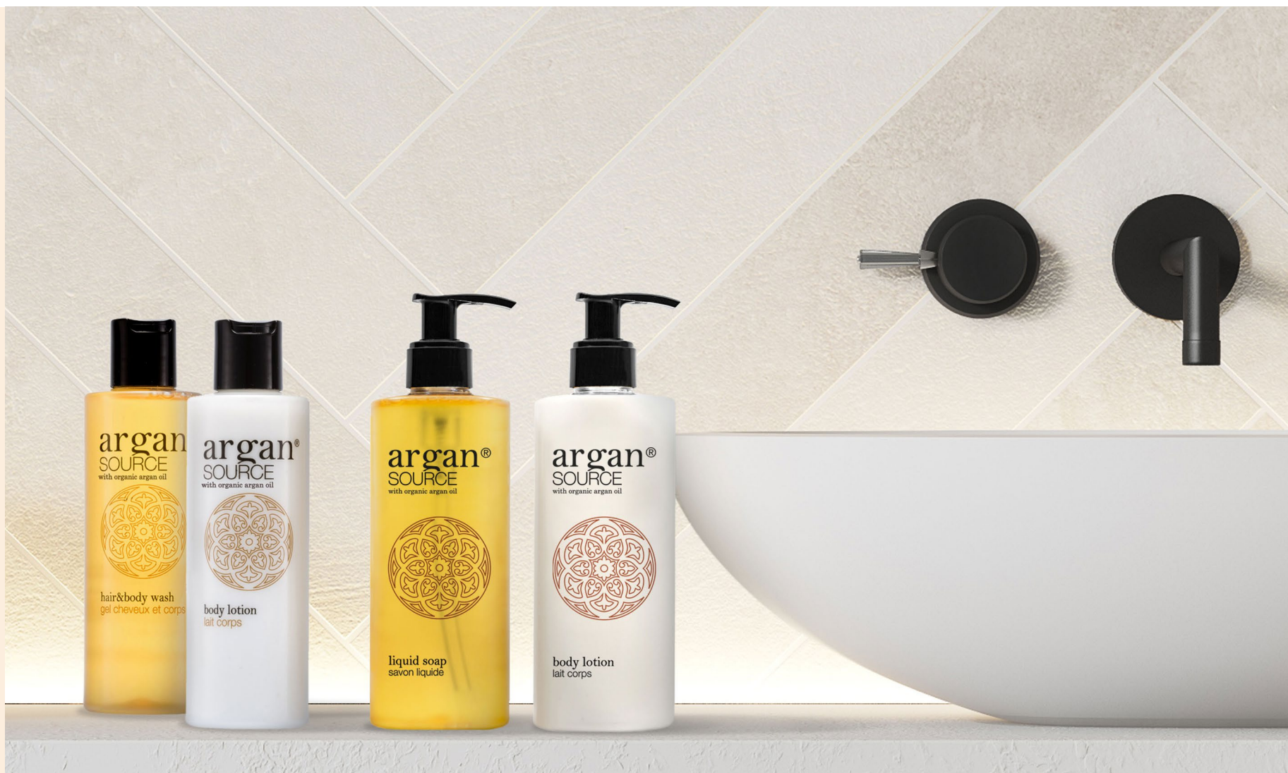
200 ml - 300 ml Dispenser