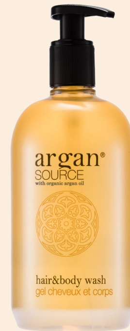
HAIR&BODY WASH 500 ml