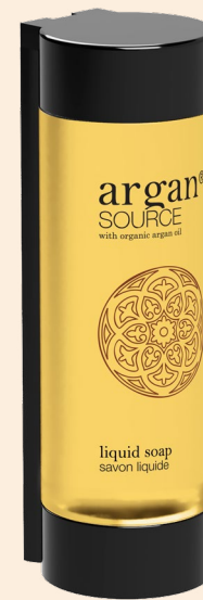
LIQUID SOAP 350 ml

transparent frosted dispenser with shiny black braket