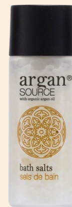
BATH SALTS 37 g