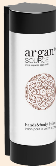
HANDS&BODY LOTION 350 ml