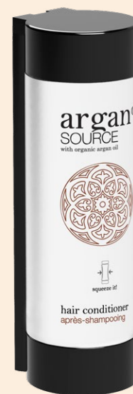
HAIR CONDITIONER 320 ml