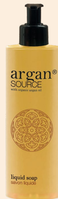
LIQUID SOAP 400 ml