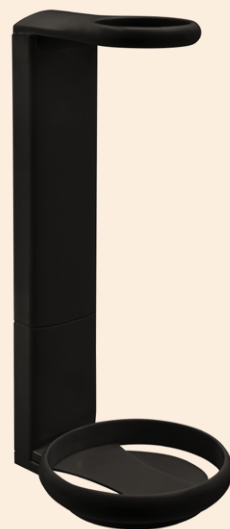
SUPPORTO CLASSICO plastica nera