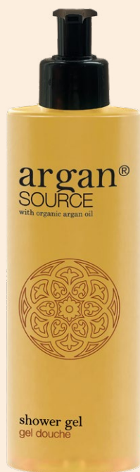
SHOWER GEL 400 ml