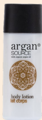
BODY LOTION 30 ml