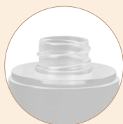
screw cap for refill