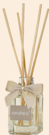
ROOM DIFFUSER 40 ml