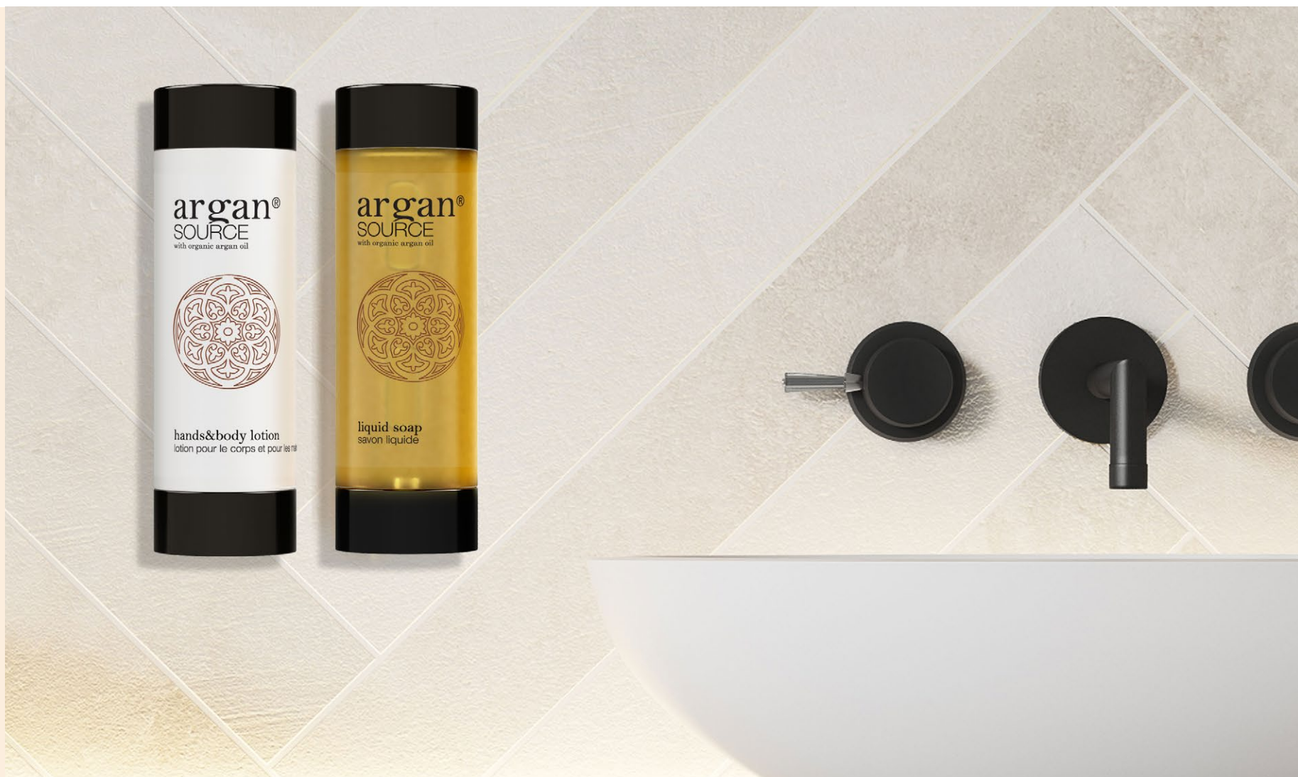
Refillable dispenser “Trend Plus” (320 ml) - pag. 21 / dispenser “Trend” (no refill - 350 ml) - pag. 22