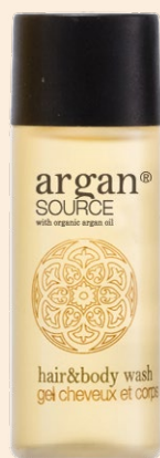
HAIR&BODY WASH 30 ml