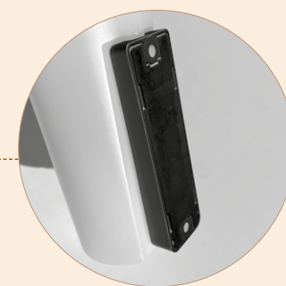
BLACK PLASTIC WALL-BRAKET