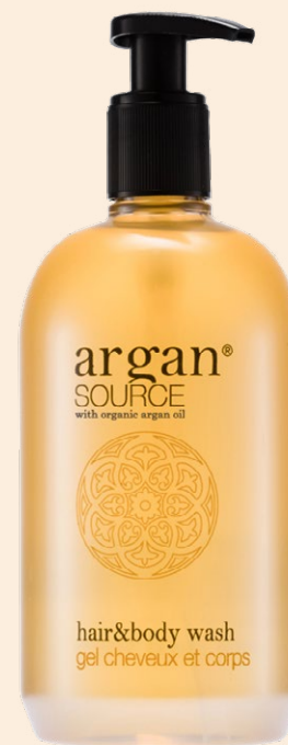
DISPENSER Pure 500