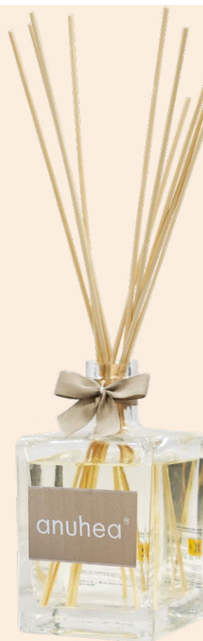
ROOM DIFFUSER 400 ml