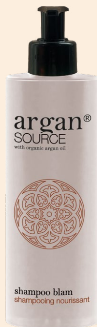
SHAMPOO BALM 400 ml