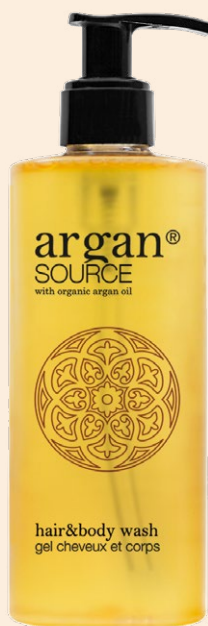
DISPENSER Round 300