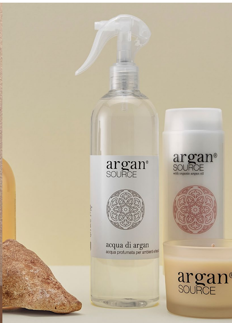
500 ml Spray scented water