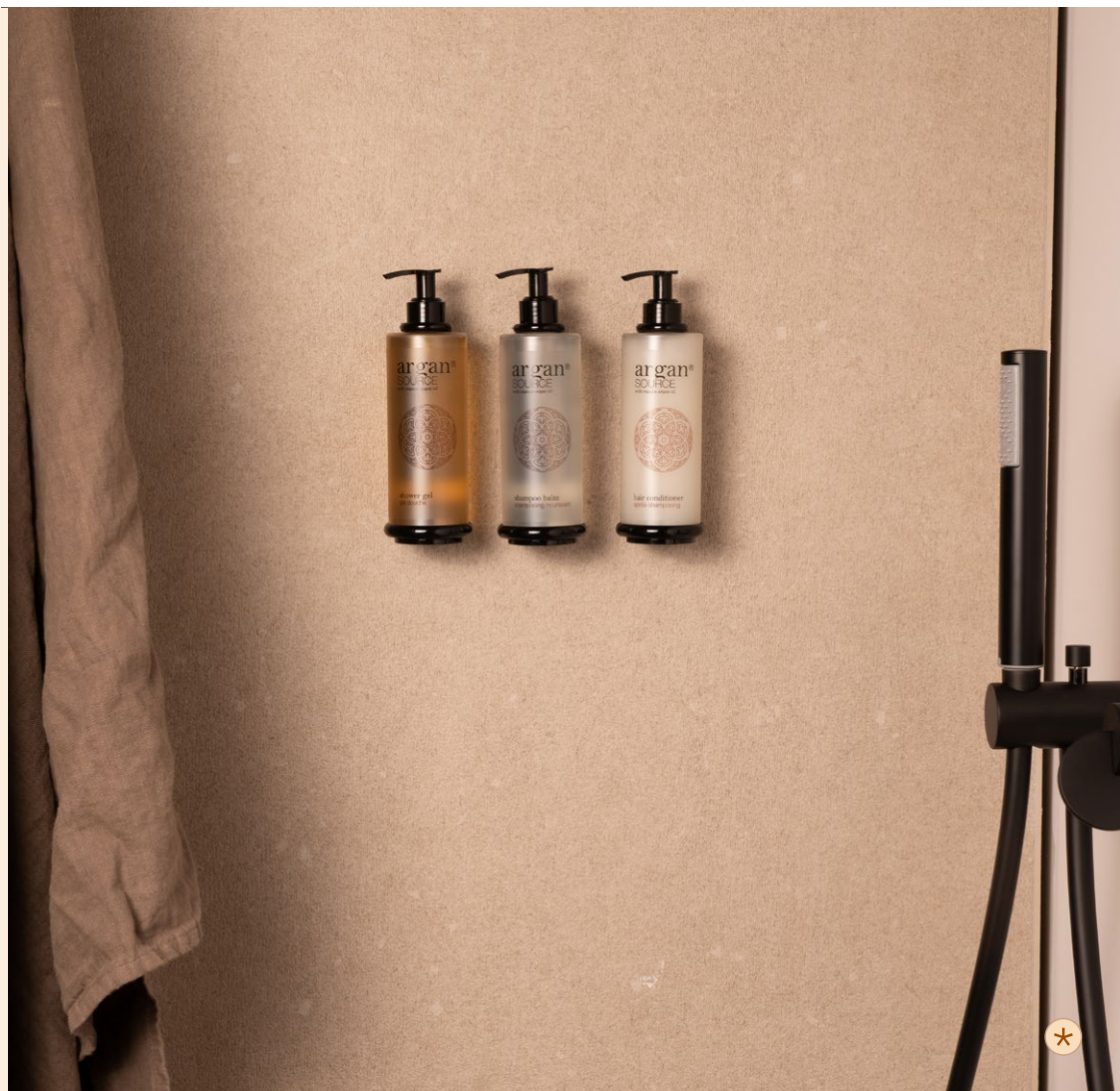
Dispenser “Round 300” (300 ml) - pag. 20