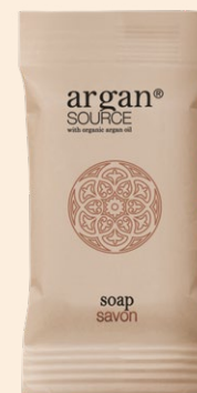
SOAP 15 g