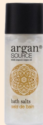
BATH SALTS 37 g