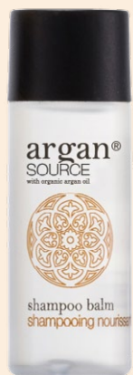
SHAMPOO BALM 30 ml