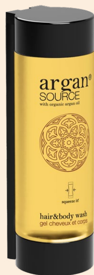
HAIR&BODY WASH 350 ml