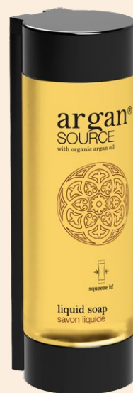
LIQUID SOAP 350 ml