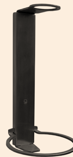
SUPPORTO INVIOLABILE acciaio inox