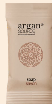
SOAP 20 g