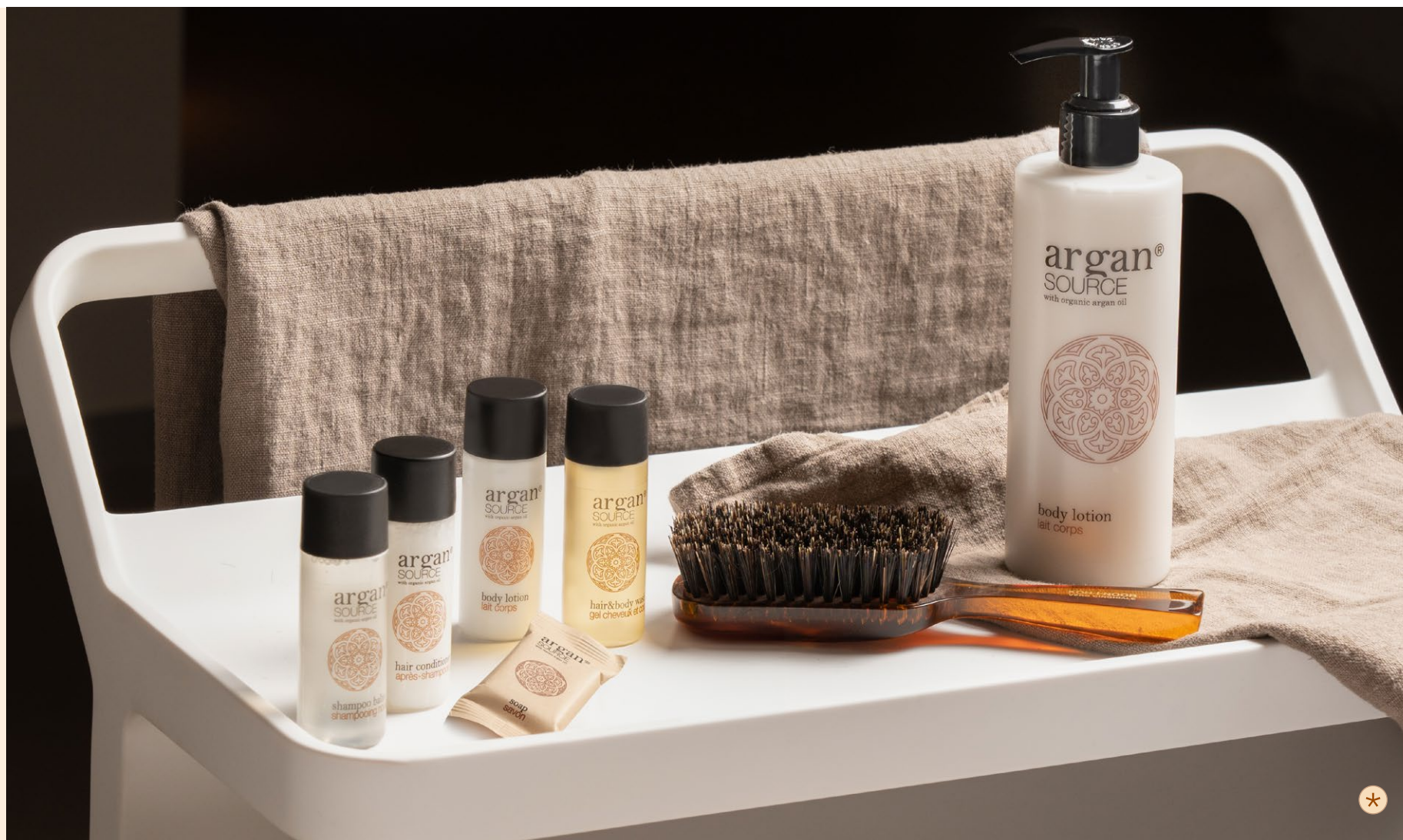
Amenities line - pag. 19 Dispenser "Round 300" - pag. 20