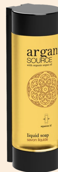
LIQUID SOAP 320 ml