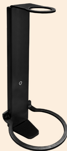
SUPPORTO INVIOLABILE acciaio inox