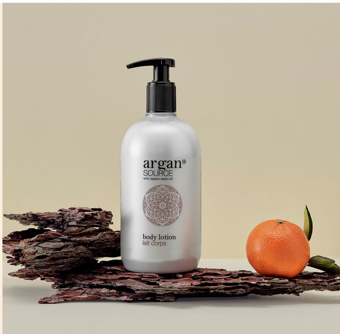
Dispenser “Pure” (500 ml) - pag. 24