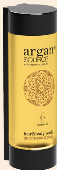
HAIR&BODY WASH 320 ml