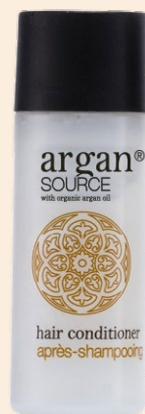
HAIR CONDITIONER 30 ml