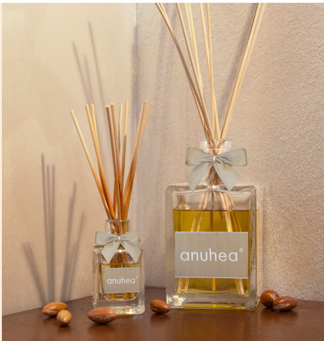
40 ml - 400 ml Room diffuser