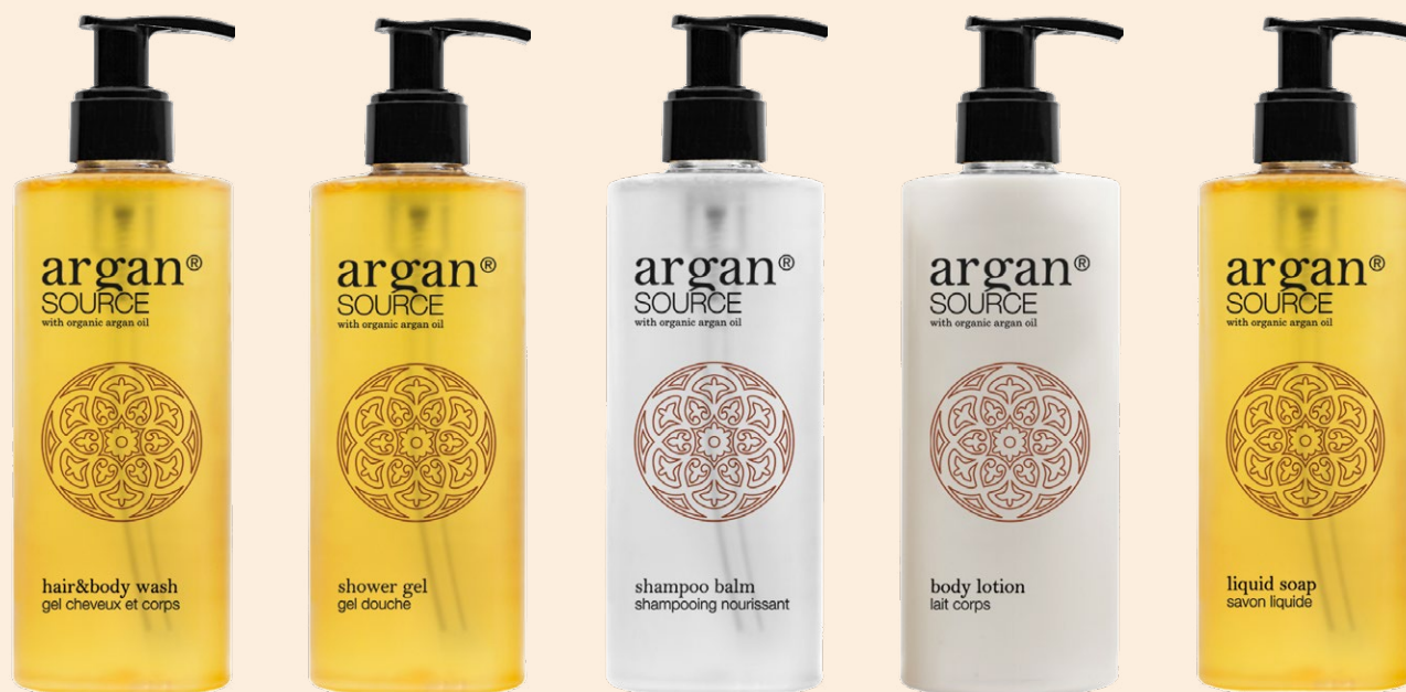
HAIR&BODY WASH 300 ml