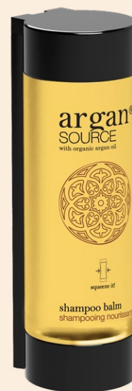
SHAMPOO BALM 320 ml