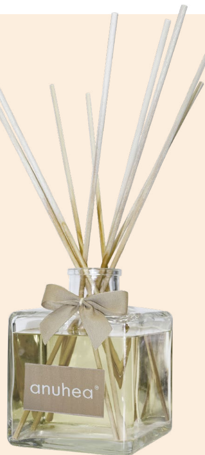
ROOM DIFFUSER 2 L