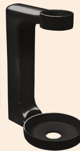
SUPPORTO CLASSICO plastica nera