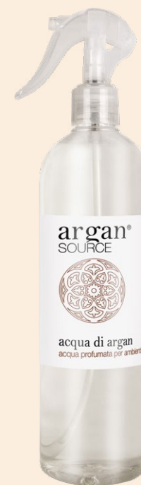
SCENTED WATER 500 ml