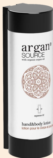
HAND&BODY LOTION 320 ml