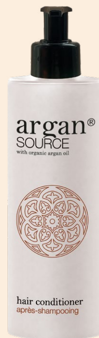
HAIR CONDITIONER 400 ml